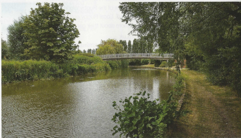
The Grand Union Canal is already a pretty place

In the four years I've been involved in the Canal & River Trust, who manage the canal system across England and Wales, I've been impressed how they and their predecessors have exploited opportunities for many art forms: poetry carved into new lock gates; appointment of a succession of canal laureates; film or theatre aboard narrow boats; heroic sculptures like the giant Kelpies by the Falkirk Wheel; taking youngsters on a life-changing Shakespearian trip from Stratford (East) to Stratford (upon Avon); dance on or around the waterway. There's no shortage of great ideas and great artists to put them into effect. The key ingredient is an organisation able to make them happen.