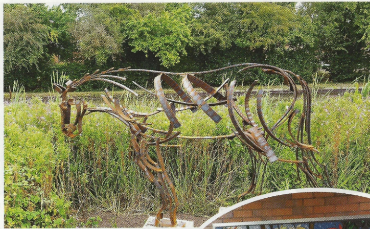
Ghostly transparency from a golden age

The striking three post bench Jeremy has made for this commission derives its design from the sculptural benches Jeremy made for Woburn Safari Park. The oak posts and the head rail across the top present robustly carved and brightly coloured relief images of the wildlife of the canal including coarse fish, coot, moorhens, ducks, geese and swans, water beetles, snails, flying insects and all the micro life too: the insect larvae, diatoms, floral algae, hydra and amoebae. And it's not only a comfortable place to sit, but you can also see across the canal to the next piece in the trail.