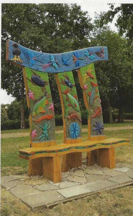
Illustrated wildlife from Jeremy Turner, ctsy JB