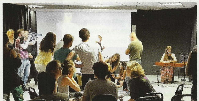
Body art, film, music, dance and audience at Bodies as One in July