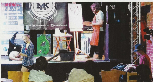
Narrated art, music, dance and audience at Art in Motion in July

Norfolk House is full, but we have space for visual artists at Clyde House Studios . And we're in the throes of pulling together a very exciting proposal for future use of the former CMK bus station, with a combination of cultural café, display of MK's best ideas, digital accelerator, permanent centre for urban arts and outside space for cultural events. Fingers crossed.